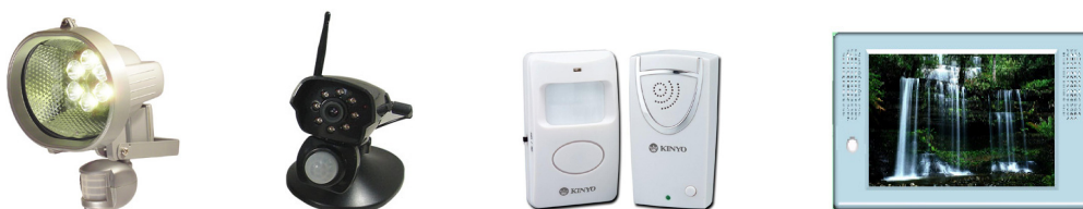
Various Passive Infra Red Products (Auto Lighting, Security, Automatic Door Inform System, Auto Display, etc.)