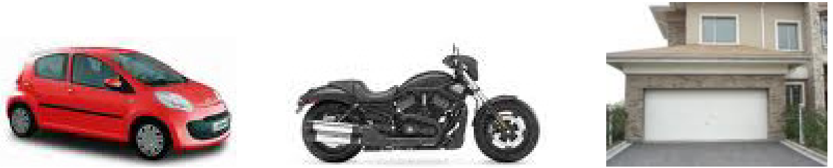
Motorcycle, Car, Wireless RF Receiver Applications