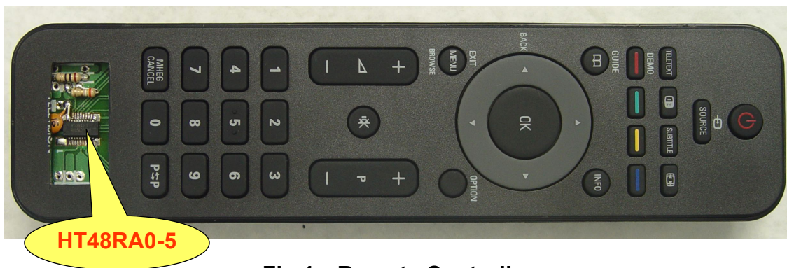
Fig 1 : Remote Controller