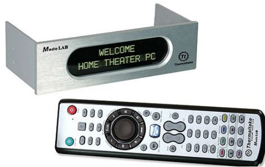
Various Infrared Remote Controllers